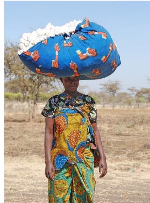
Cotton Picker in Tansania

The African cotton textile industry is highly fragmented. It lacks connections to upstream stages such as cotton growing, ginning and domestic marketing. Less than 20 percent of the cotton produced in Africa is processed into marketable products on the continent, while the rest of the raw material is exported. Opportunities for change are seen in a historically observed trend towards the relocation of textile production to less developed countries. In principle, international buyers' interest in increasing the proportion of sustainably produced cotton textiles from emerging regions is growing. This increases the chances of foreign direct investment.