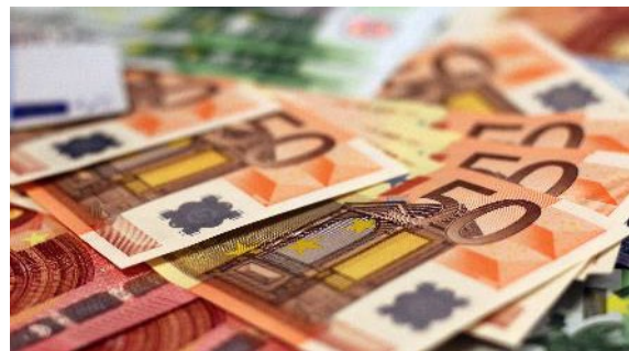
Euro Banknotes Manufactured from Cotton